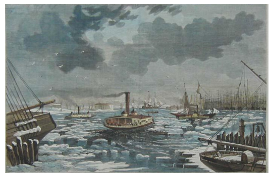
Ships plowing through ice on East River, winter of 1851

speaking community in the city, but most of the city's public assistance resources were being expended upon the immigrant Irish who were escaping their own "Potato Famine," an immigration process that peaked the same year the Heydingers landed. So essentially the Heydingers were on their own immediately.