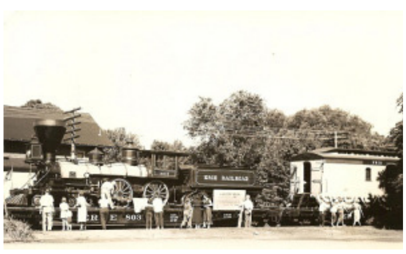
Restored Erie Railroad locomotive used on the Albany to Buffalo route in the 1850's.

However, the same family lore is confusing as to where exactly the family stayed that first winter. Some say that he wintered in Buffalo, others in Erie PA. Dunkirk - where the train line ended - is situated almost exactly between